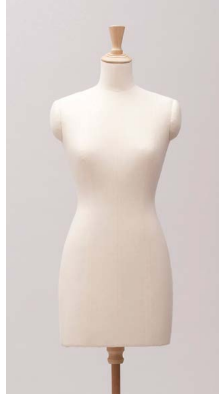
9040 | FITTED

A well-proportioned shape incorporating in-built padded shoulder caps is specifically designed for jackets and tailoring .