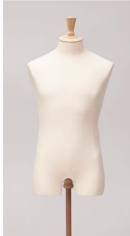
BUS04 | CLASSIC

A block-shaped bust form with a low waist-hip ratio and sloped shoulders make this classic shape the perfect choice for tailoring .