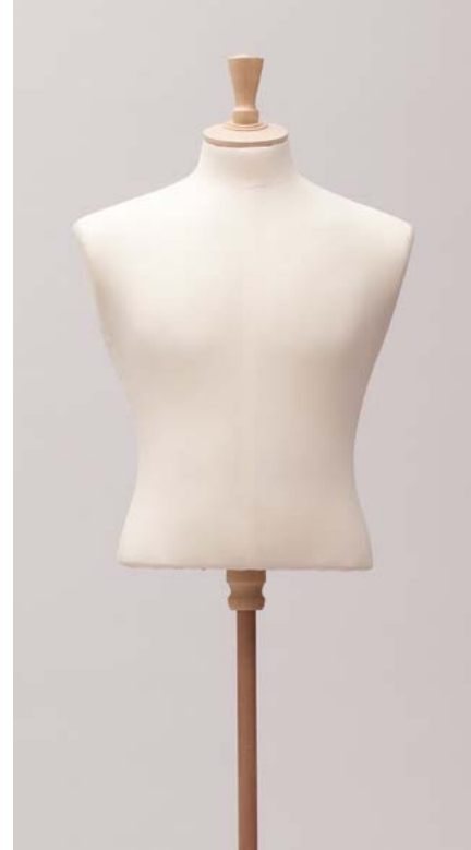
6000 | BODY CONSCIOUS

A muscular physique , featuring a heavily built chest, makes this bust form an excellent choice for form-fitting items.