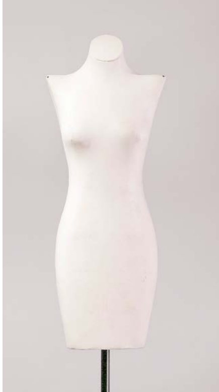
RET01 | MODERNE