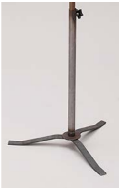
WORKROOM TRIPOD BASE