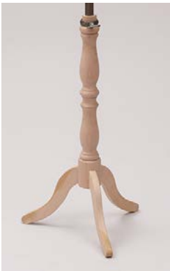
WOODEN TRIPOD BASE