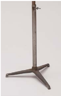
CAST IRON TRIPOD BASE