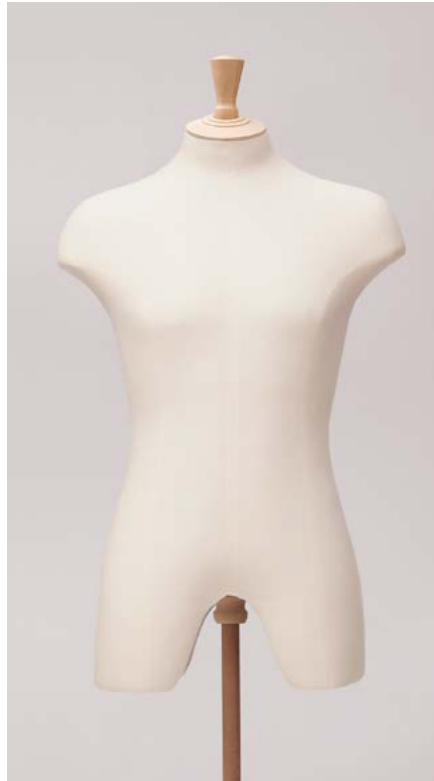
BUS03 | PREPPY

This preppy-inspired mannequin sports a broader chest and larger build to accentuate form-fitting clothing, such as classic t-shirts.