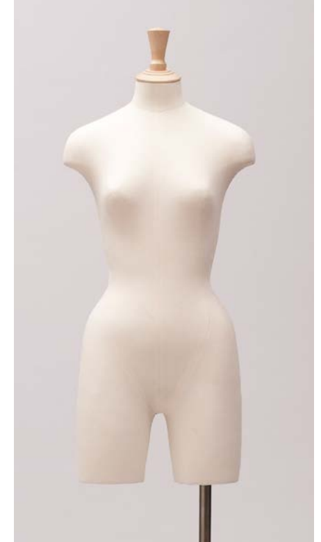
9045 | CORSET

This curvaceous bust form, featuring a shaped bottom and crotch area, is designed specifically to suit lingerie and corsetry items.