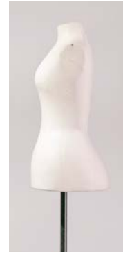
RET04 | BELLE EPOQUE