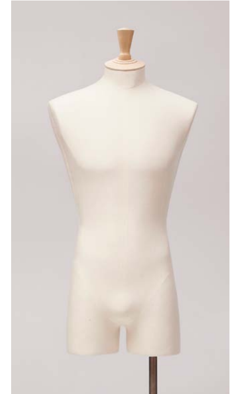
BUS05 | CASUAL

This unique shape featuring slim hips and a small bottom was specifically created to display drop-crotch denim and baggy-fit trousers.