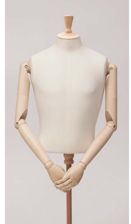
BUS02 | HERITAGE

With wooden articulated arms and a shorter body, this bust form is specifically designed to display shirts and jackets .