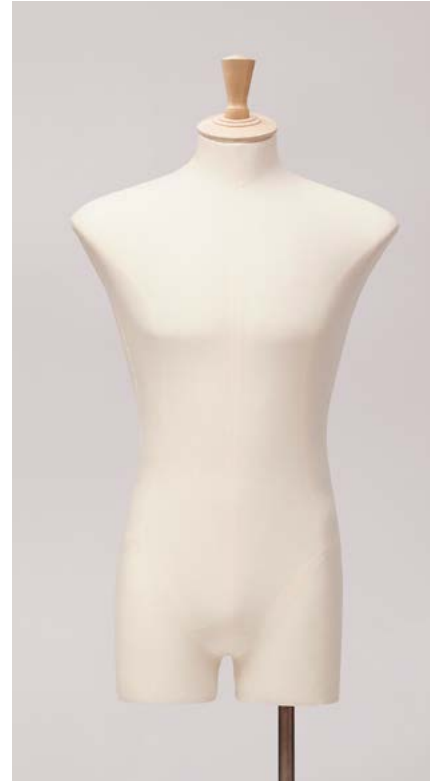
BUS07 | SOPHISTICATED

A slender and sophisticated bust form with a small chest make this shape ideal for high fashion and slim-fitting garments.