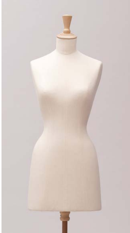
9030 | FLARED SKIRT

This shapely bust form has a large waist-hip ratio to accommodate skirts, dresses, eveningwear and other flared garments .