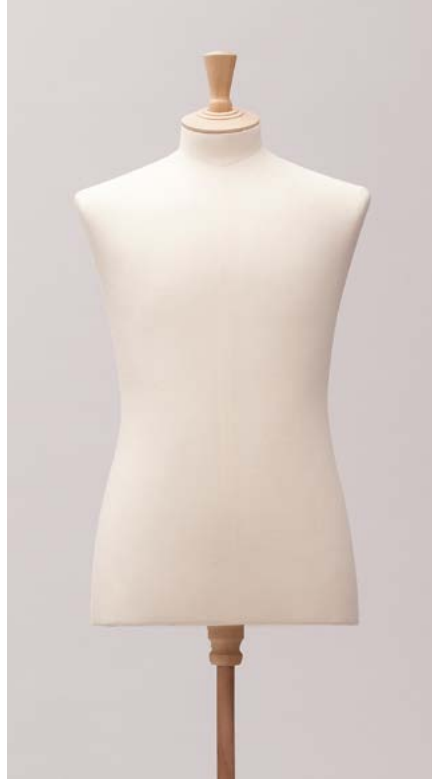
9060 | CONTINENTAL

This fashion-forward shape has a lean, svelte body with a flatter chest that's perfect for displaying modern styles .