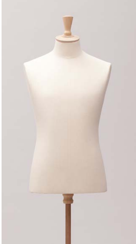
9050 | BRITISH

Our classic bust form shape is the perfect partner for the 'Petite' female form. With an aristocratic build and full chest, the figure is ideal for formal tailoring and mature clothing.