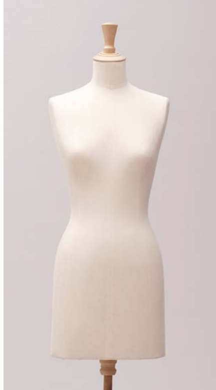
9038 | LONGLINE

With a long length body, this bust form is specifically designed to display full length items such as ball gowns and evening wear.